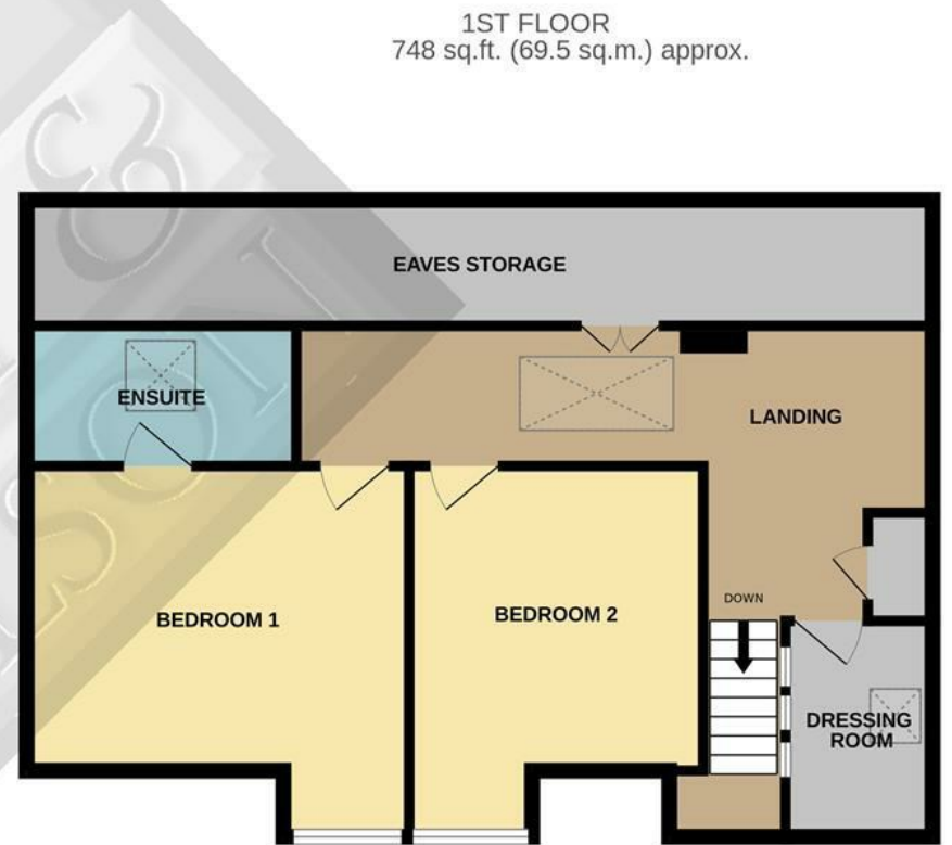
1ST FLOOR 748 sq.ft. (69.5 sq.m.) approx.

TOTAL FLOOR AREA : 1913 sq.ft. (177.7 sq.m.) approx.