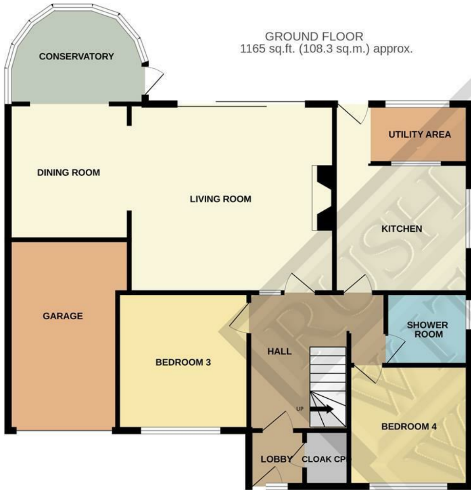
GROUND FLOOR 1165 sq.ft. (108.3 sq.m.) approx.